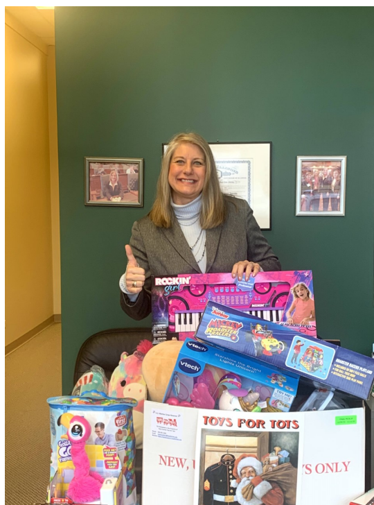
Toys for Tots 2020